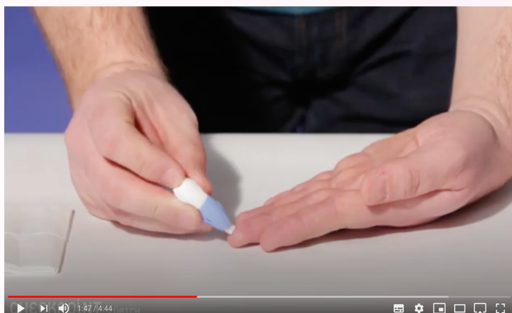
figure 1: screenshot from the instruction video.

Validation was performed with a questionnaire, including multiple-choice questions, five-point Likert scale and open questions. Lab-results were discussed with the participants via phone. People with symptoms of a sexually transmitted infection were excluded and asked to come to the clinic. An interim analysis was performed after the first twelve results. PrEP medication was delivered via mail after the phone consultation.