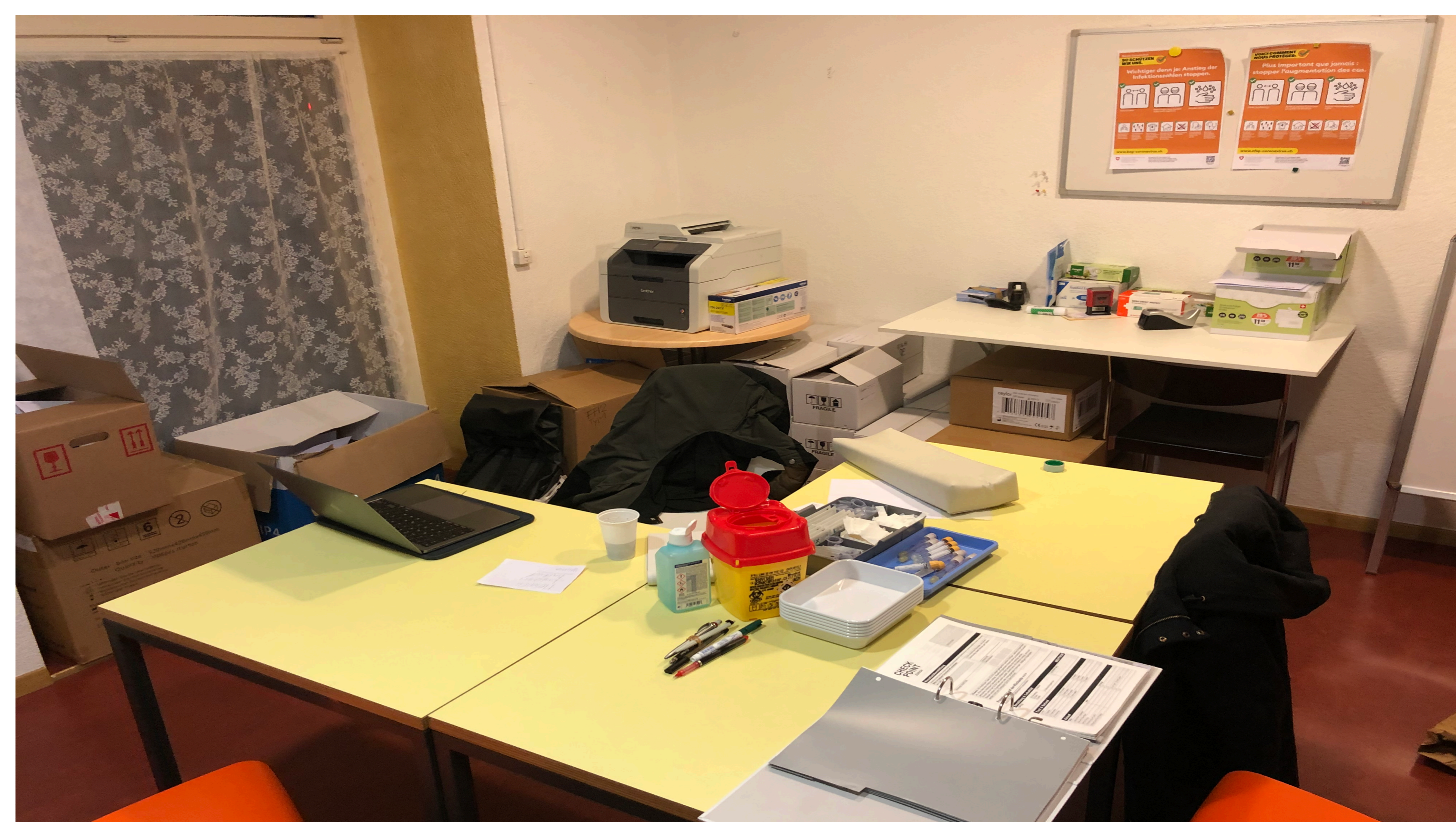
The night-café offers monthly walk in PrEP consultations for trans and male sex-workers with same-night PrEP start

Reference: 1. Hovaguimian, et al. Participation, retention and uptake in a multicentre pre-exposure prophylaxis cohort using online, smartphone-compatible data collection. HIV medicine . 2021.